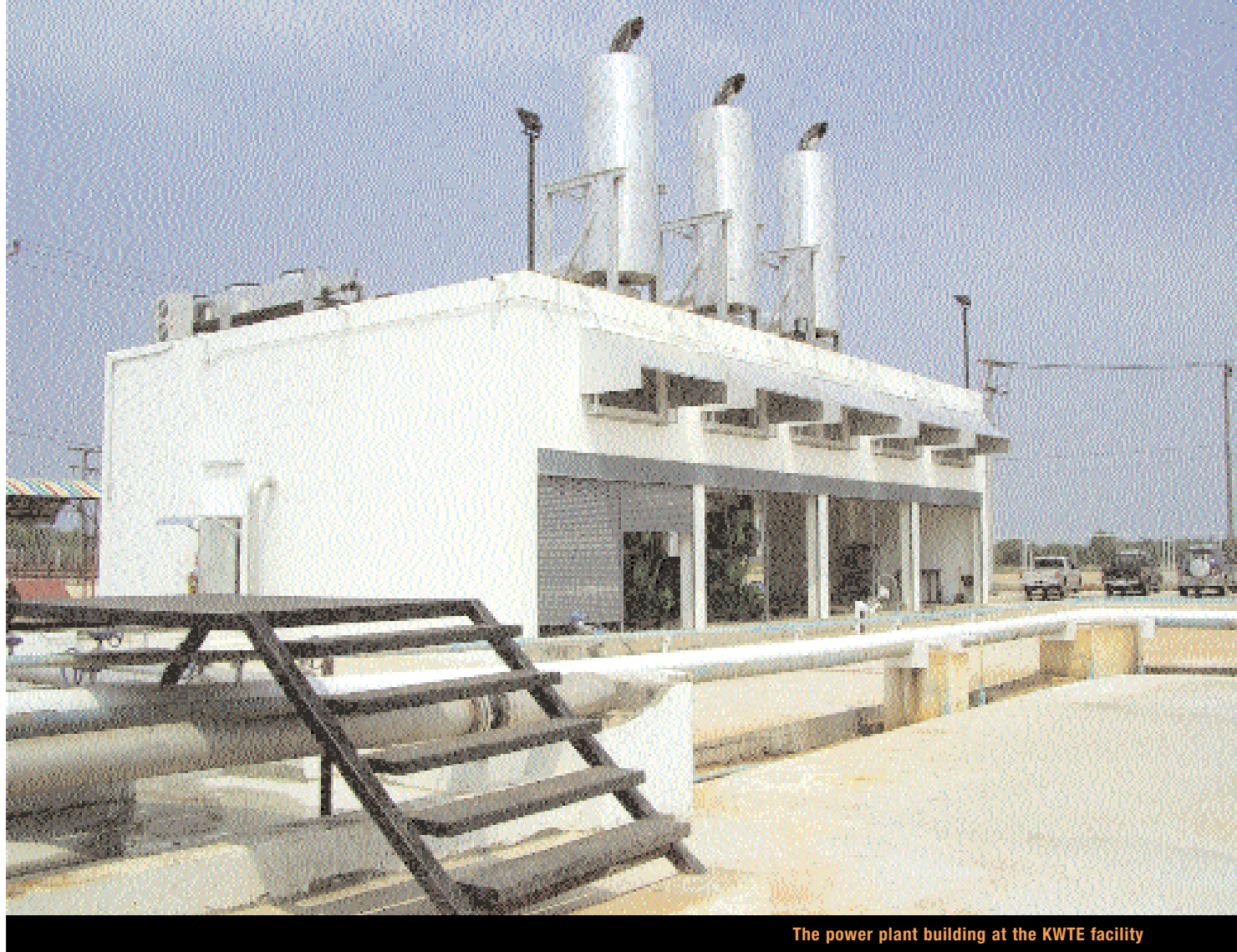
The power plant building at the KWTE facility