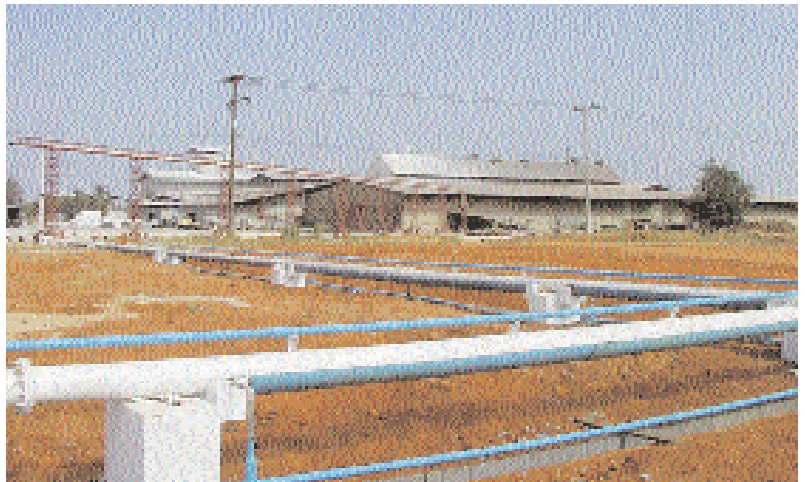
Biogas pipeline to the cassava plant

Cassava processing presents an ideal opportunity for distributed generation, coupling an excellent renewable resource with large heat and electricity loads. Significant energy is required to dry the starch, reducing its moisture content from 70%-80% to 15%-17% for bagging and shipment.