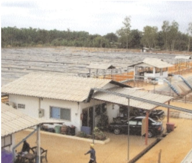
Overview of the digester energy plant

management risks that can otherwise prevent factory owners from implementing turnkey systems.